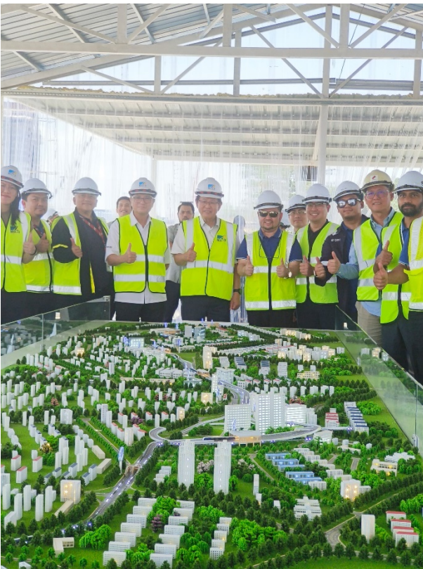
The delegates and Sarawak Metro team gathered in front of the Red Line scale model, showcasing the project's progress and vision.

For media enquiries, please contact the Sarawak Metro Corporate Communication team :