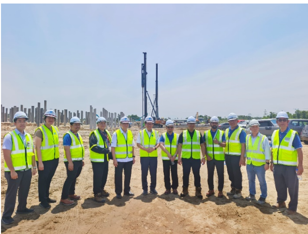
The delegates observed the piling activity at the Rembus Depot

For media enquiries, please contact the Sarawak Metro Corporate Communication team :