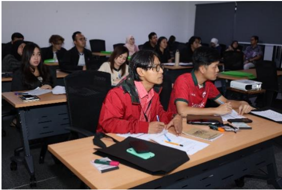
The participants focusing intently during one of the sessions of the Technical Mandarin course