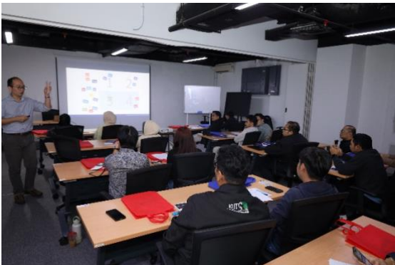
An instructor interacting with participants of the Technical Mandarin course