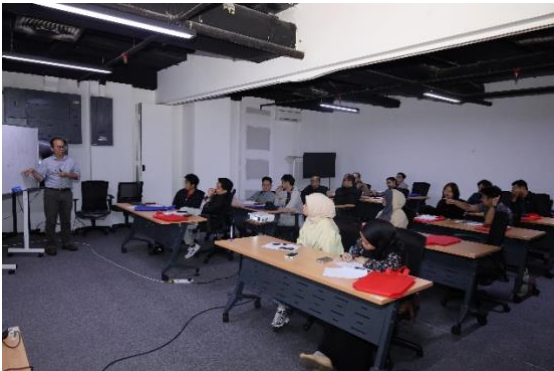
Participating staff members engrossed in the session during the Technical Mandarin course

For media enquiries, please contact the Sarawak Metro Corporate Communication team :