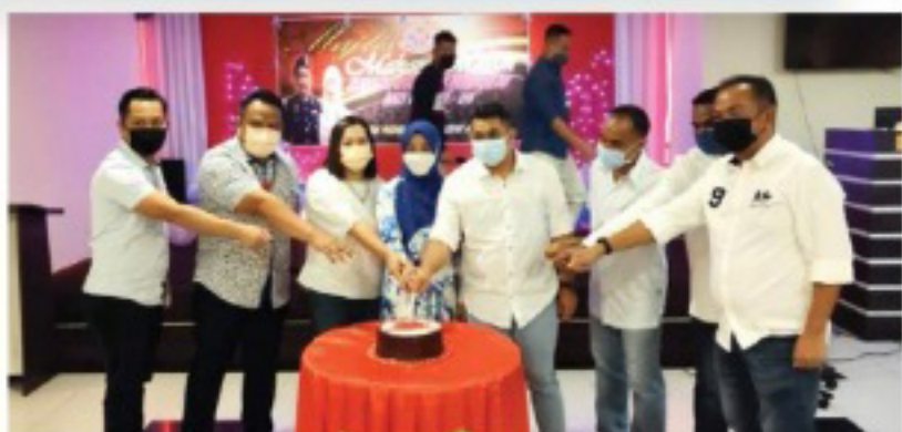
The cake-cutting in process.